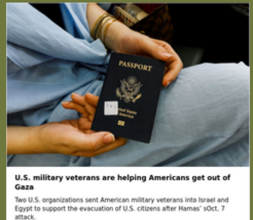
U.S. military veterans are helping Americans get out of Gaza

TAUGHT SURVIVAL TECHNIQUES TO THOSE STUCK IN GAZA (I.E. HOW TO MANEUVER TO SAFE LOCATIONS, HOW TO DISTILL BRACKISH WATER AND URINE, AND HOW TO EXTRACT WATER FROM LEAVES)