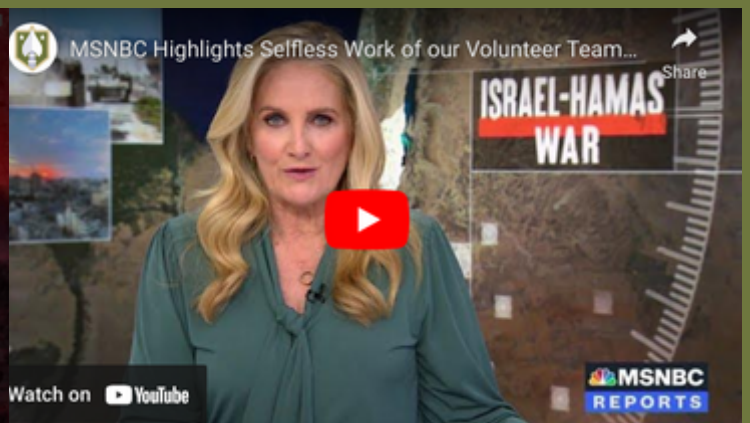
MSNBC DID A VETERAN'S DAY SPECIAL FEATURE OF OUR WORK EVACUATING AMERICAN CITIZENS FROM ISRAEL AND GAZA